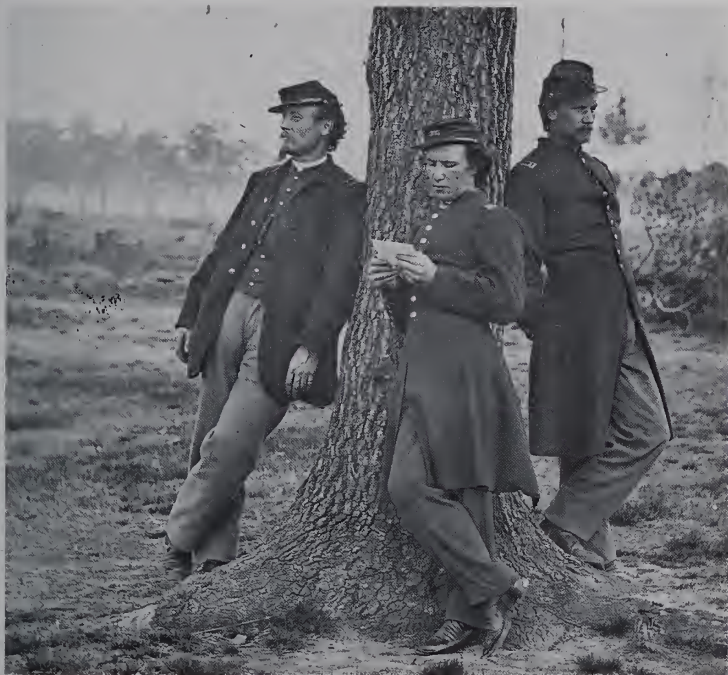
Officers of Company C, 1st Connecticut Artillery, at Fort Brady, James River, Virginia.